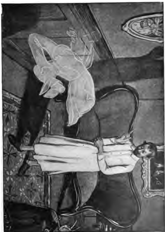
DOWN UP AND STARTY THROUGH THE WAINSCOTING OF THE ROOM."